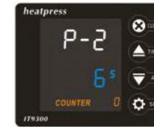
P-2 : Time Setting Mode Touch SET & ↑↓ buttons to set desired time.