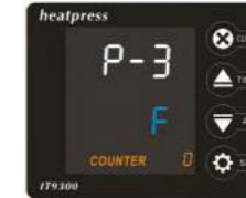
P-3 : °C or °F Read-out Touch SET & ↑↓ buttons to set °C or °F