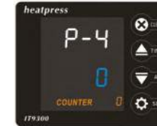
P-4 : Auto Power-off Mode Touch SET & ↑↓ buttons to set auto-off time with 0-120 mins range