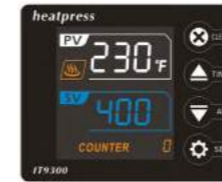
Control Panel Display