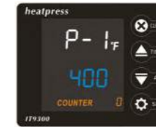
P-1 : Temp. Setting Mode Touch SET & ↑↓ buttons to set desired Temp.