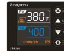
Wake Machine from Sleepy Mode You can wake up the heat press from sleepy mode by touching any button on the control panel, and machine starts to heat again.