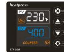
Clear Counter NO. You can long hold the CLEAR button to clear the COUNTER NO. on the panel.