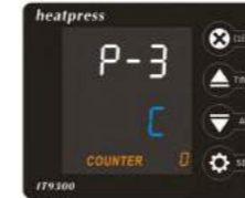
P-3 : °C or °F Read-out Touch SET & ↑↓ buttons to set °C or °F