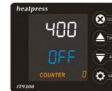
Auto-off Introduction It reads OFF and machine starts to cool down after machine raises to SET temp. and remains no operation for P-4 set time. Operation like control panel setting or heat pressing.