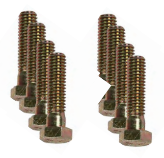
Four (4) Hex Bolts 3/8-16" x 1/2"