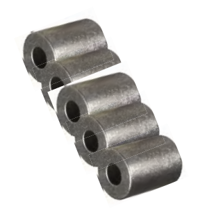
Five (5) WA-1001