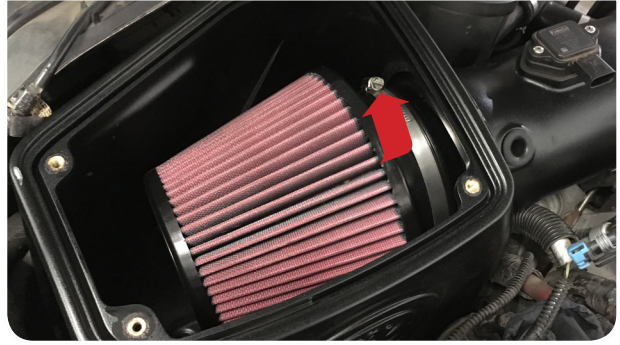
Remove the protective covering on the Clear Lid (B).