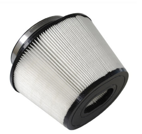
Replacement Dry Filter SKU# KF-1051D