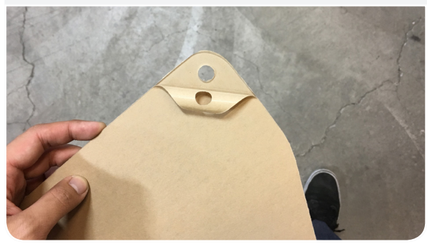
Remove the filter minder from the stock intake box and insert it into the Intake Tube (C).