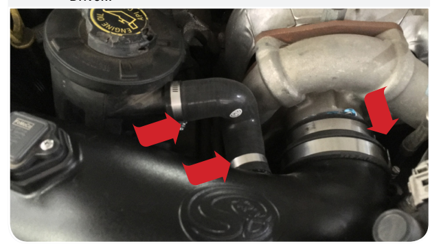
Press the Lid Seal (R) into the groove on top of the Air Box (A).

Tool Required: 1/4", 5/16" Nut Driver or Flat Blade Screw Driver..