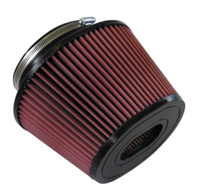
Replacement Cotton Filter SKU# KF-1051