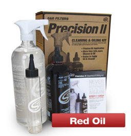
Precision II: Cleaning & Oil Kit SKU# 88-0008