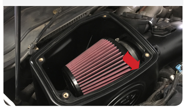
Place the Clear Lid (B) on top of the Air Box (A) and secure with the 10-24 Screws (L) and Lid Washers (K). Tool Required: Screwdriver