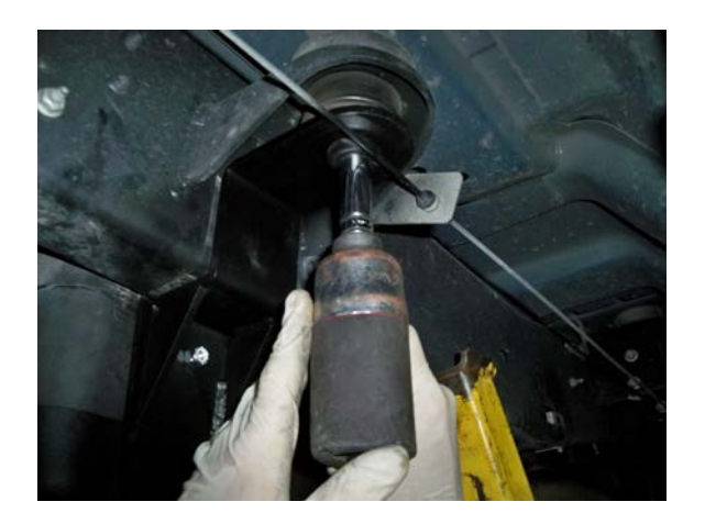
(Fig. 10) Replace cab mount bolt with its existing washers and tighten to factory specification.