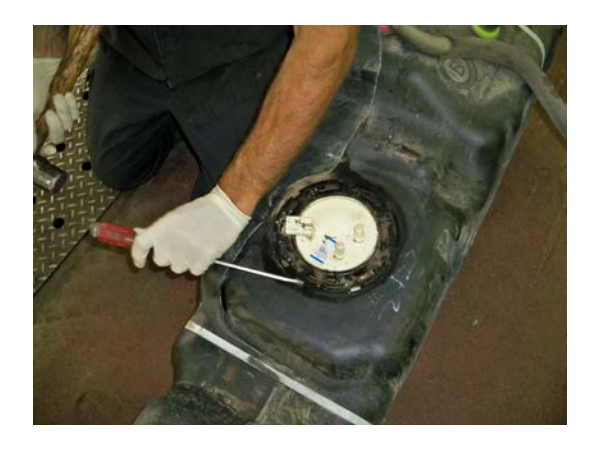
(Fig. 2) Loosen hold-down ring on original equipment tank by tapping counter-clockwise, remove and lift out sending unit.

(Fig. 1) Remove original equipment strap and "bumper bracket", shown here to the right-hand side of the front strap.