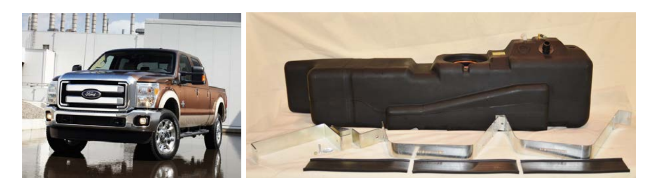
Extended Capacity Replacement Tanks for FORD Diesel Trucks

7020211 For 2011+ FORD truck models F250 & F350 : Crew Cab, Short Bed (6 ½ ft.) 7020311 For 2011+ F250, F350 & F450 (with pickup bed): Crew Cab, Long Bed (8 ft.)