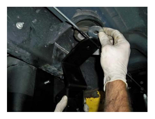
(Fig. 8) Place the supplied fender washer into the center of the rubber cab mount above the upper piece of the assembly.