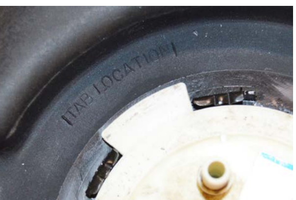
(Fig. 3) O-Ring gasket shown installed correctly.