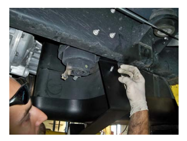
(Fig. 7) Hang lower piece of support assembly on lower lip of vehicle frame and slide towards the rear of vehicle until it lines up with cab mount.