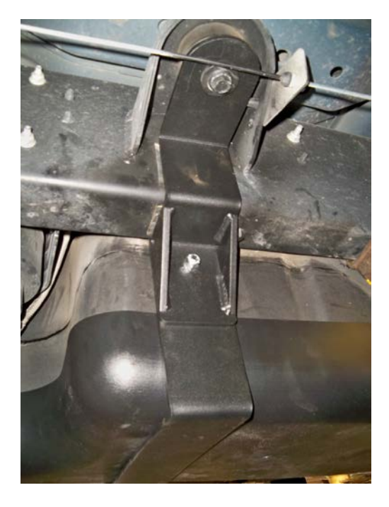
(Fig. 11) Completed front support installation on tank with TITAN Shield.