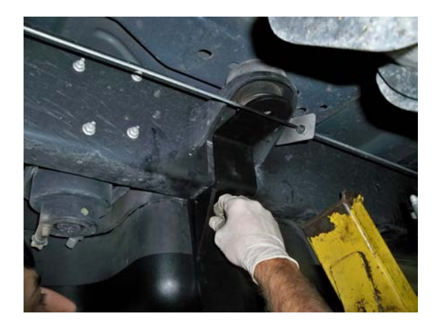
(Fig. 9) Mount the upper piece of the assembly to the lower piece using bolt provided.