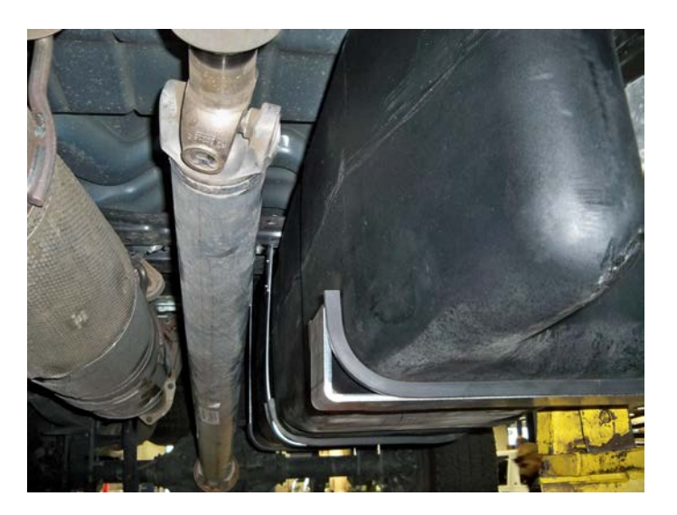
(Fig. 12) Installation of front support on tank without TITAN Shield. Note the flexible bushings on the support and the straps.