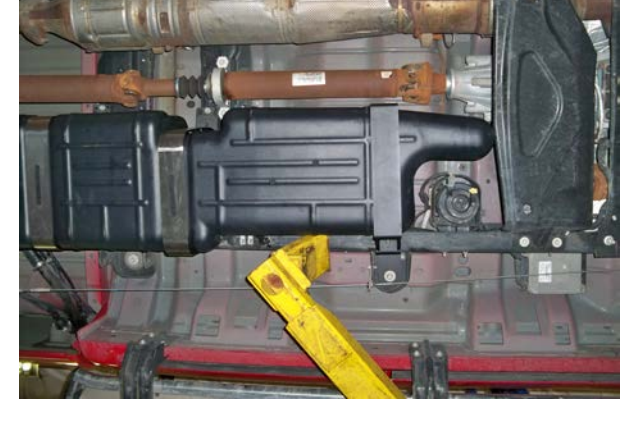
TITAN 2011+ Ford Crew Cab, Long Bed tank (7020311) installed showing three straps.