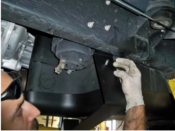
(Fig. 9) Hang lower piece of support assembly on lower lip of vehicle frame and slide towards the rear of vehicle until it lines up with cab mount.