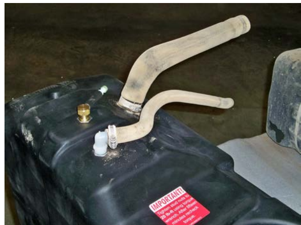
(Fig. 6) Install fill and vent hoses from original equipment tank on TITAN tank as shown. Make sure that \frac{3}{4} ” vent line is lined up with orientation mark on the tank.