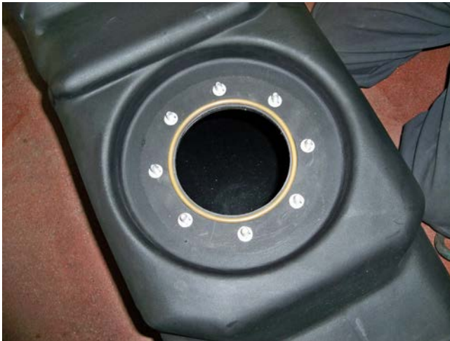
(Fig. 3) Leave the “O” ring gasket, studs and retainers assembled as they are (shown before sending unit, top flange, and 3/8” nylon locking nuts are installed).