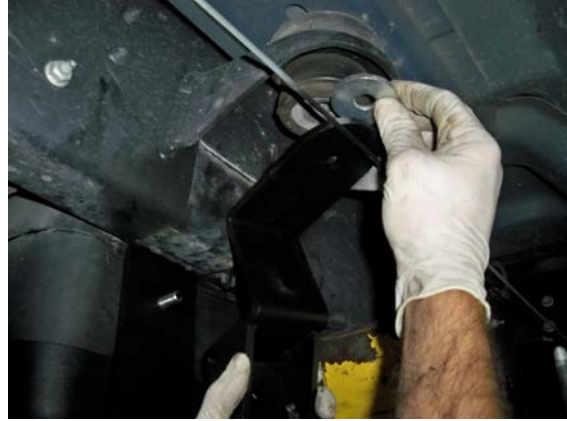
(Fig. 10) Place the supplied fender washer into the center of the rubber cab mount above the upper piece of the assembly.