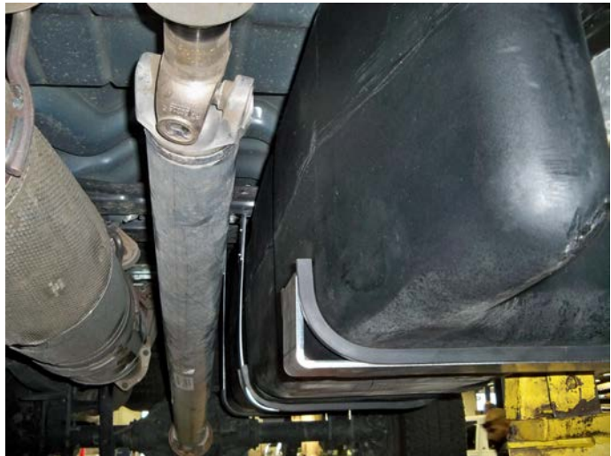
(Fig. 14) Installation of front support on tank without TITAN Shield. Note the flexible bushings on the support and the straps.