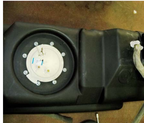
(Fig. 4) Be sure the sending unit is “clocked” the same as in the original equipment tank.