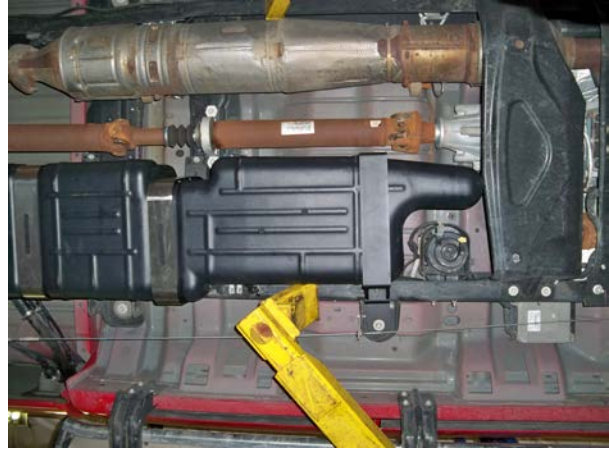
Underside view of TITAN 2011 Crew Cab Long Bed tank (7020311) with shield installed in an F450.