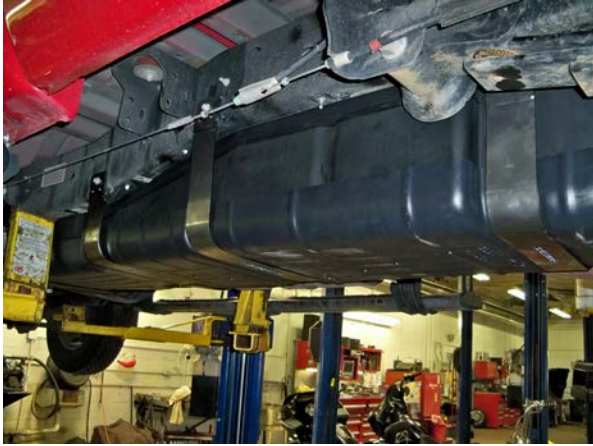
TITAN 2011 Ford Crew Cab, Long Bed tank (7020311) installed showing three straps.