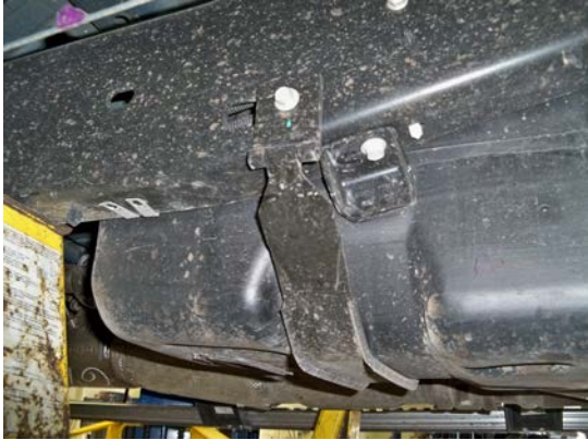
(Fig. 1) Remove original equipment strap and “bumper bracket”, shown here to the right-hand side of the front strap.