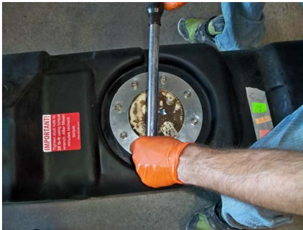
(Fig. 5) Using a torque wrench, tighten the top flange nuts to 20 lb-ft using a “star” pattern.