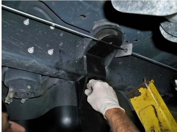
(Fig. 11) Mount the upper piece of the assembly to the lower piece using bolt provided.