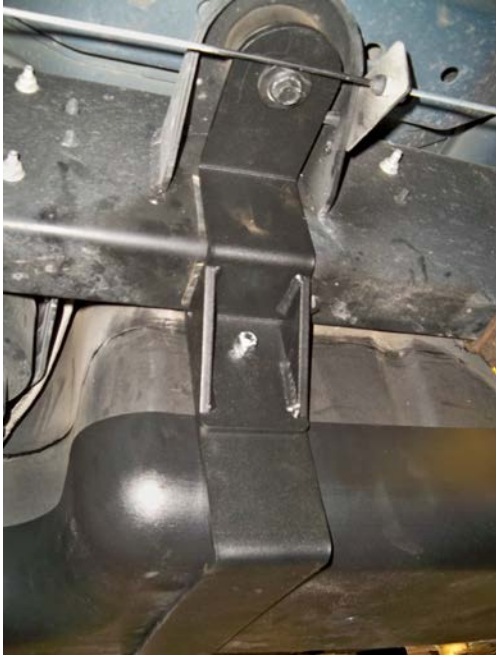
(Fig. 13) Completed front support installation on tank with TITAN Shield.