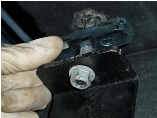
(Fig. 7) Thread two shims onto each strap bolt.