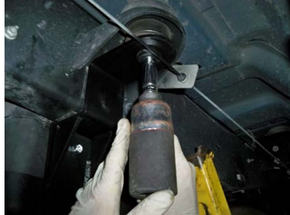
(Fig. 12) Replace cab mount bolt with its existing washers and tighten to factory specification.