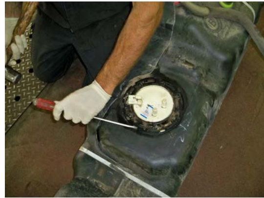
(Fig. 2) Loosen hold-down ring on original equipment tank by tapping counter-clockwise, remove and lift out sending unit.