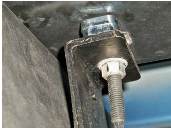
(Fig. 8) Tighten the bolt and bracket against the shims. If the strap does not hold the tank tightly enough, remove one shim at a time until it is tight.