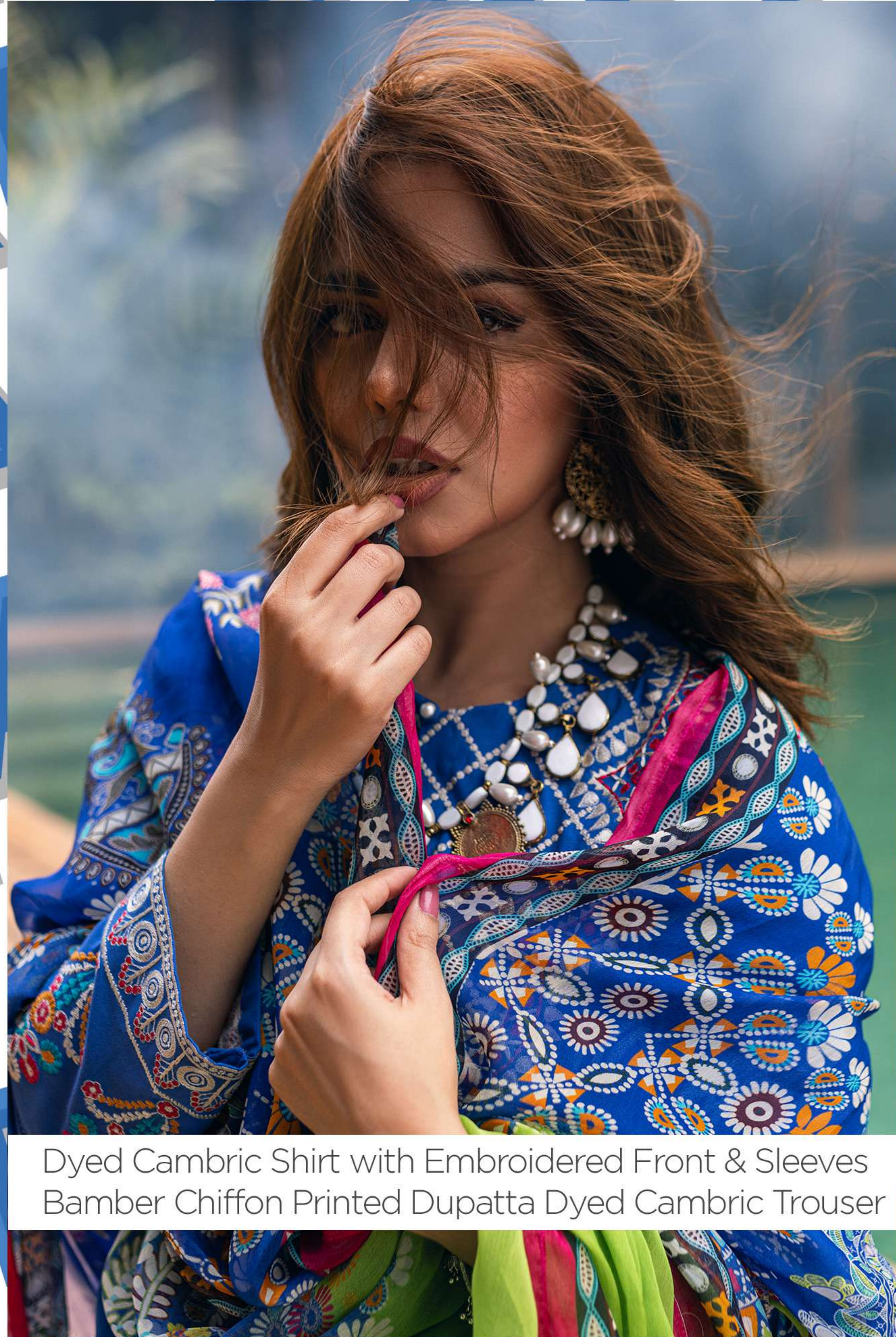
Dyed Cambric Shirt with Embroidered Front & Sleeves Bamber Chiffon Printed Dupatta Dyed Cambric Trouser