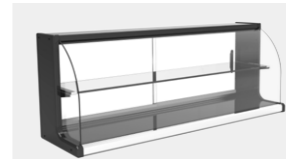
Options Top Display