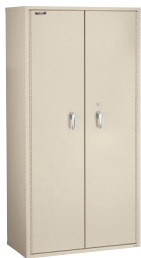
STORAGE CABINET 72" high - 4 shelves 44" high - 2 shelves