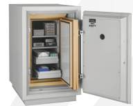
DATA SAFES Protection for data/computer media - available in multiple sizes

Look for these icons when choosing the right product for your business: