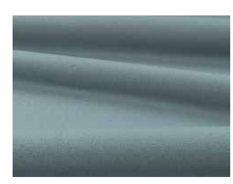
Elio FR 8028/32 Available in 41 colours