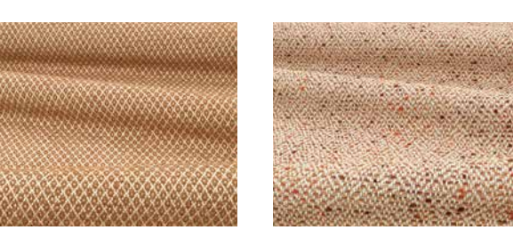
8023/06 Zolani 8024/05 Available in 5 colours