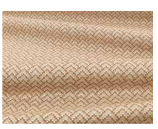
Ortico 8032/04 Available in 5 colours