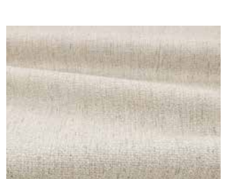
8026/01 Available in 11 colours