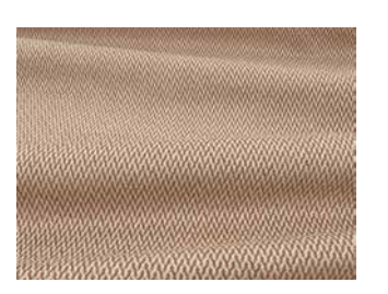
8031/03 Luiz Available in 7 colours