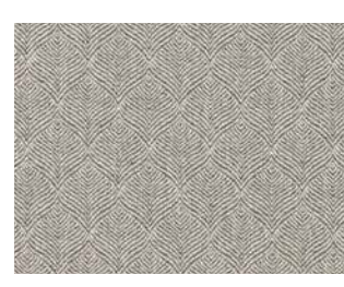
Odin 7786/03 Available in 8 colours