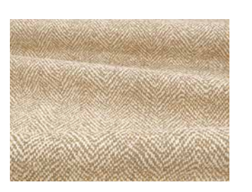
Okeyo 8025/02 Available in 4 colours