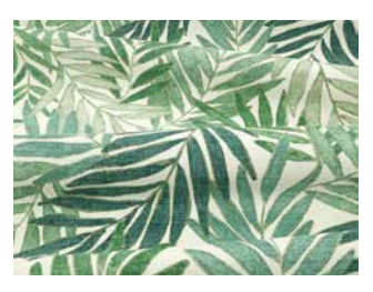
8018/02 Available in 5 colours