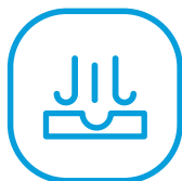
Suction Control Button