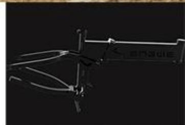
Aluminum Foldable Frame