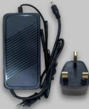
EU&UK Standard Adapter*