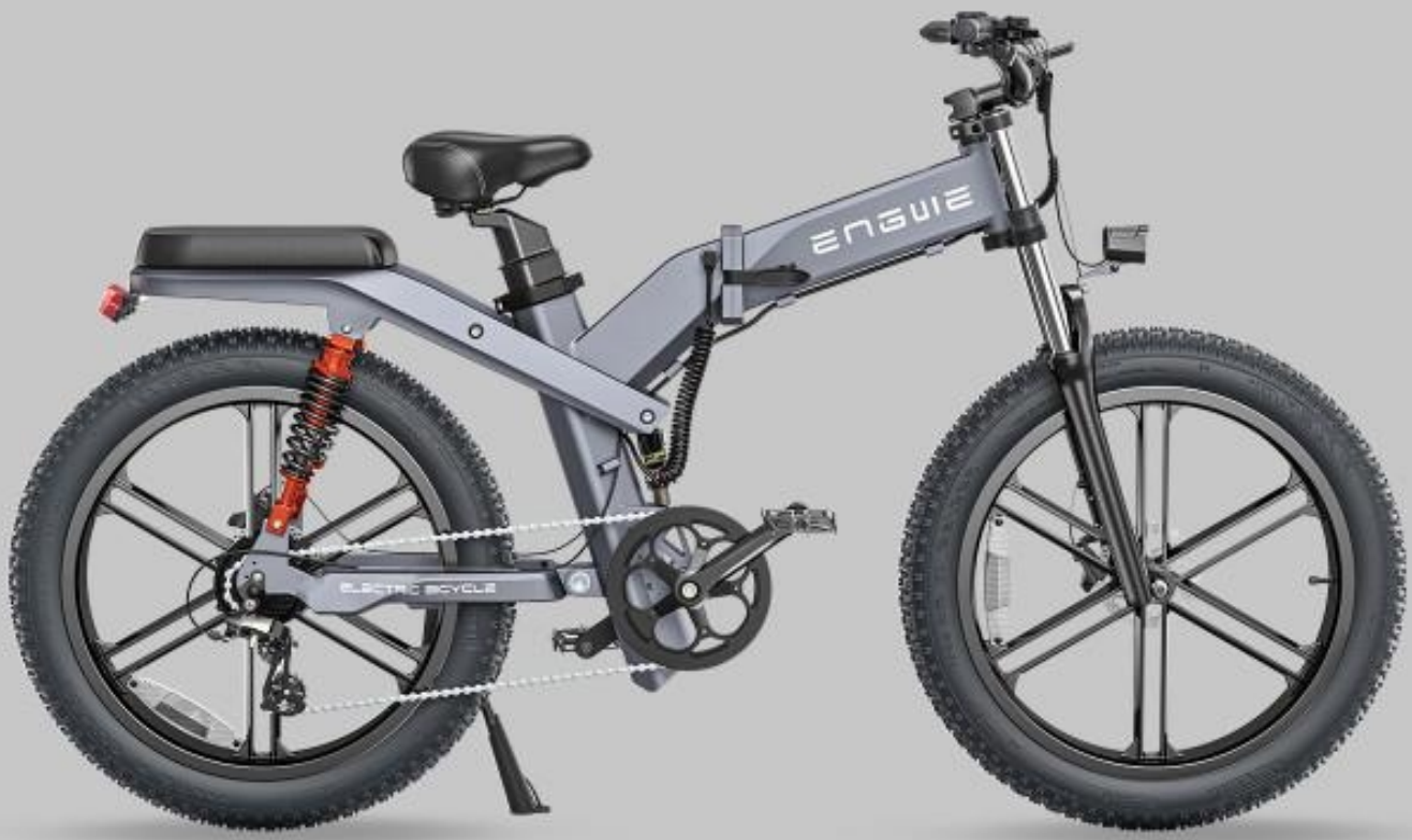
ENGWE X26 eBike