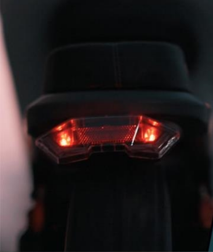
Red Brake Light