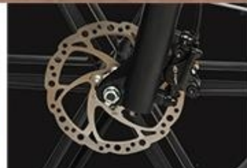
Hydraulic Disk Brakes