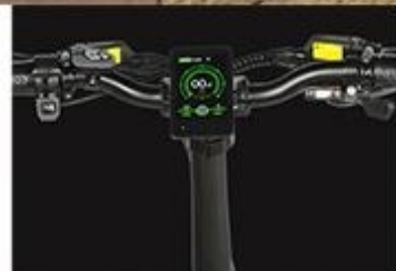
Smart & Large LCD Display