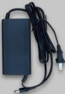
US Standard Adapter*