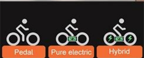
3 Riding Modes