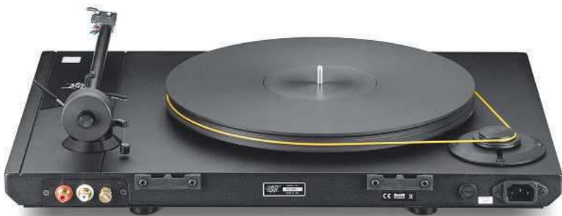
ABOVE: As with the UltraDeck, there's no external PSU here but a direct AC mains power connection. Tonearm wiring is terminated in RCA outputs and a ground post

being incremental. You know the drill because it is the definition of an upgrade path. The sheer wonder of the StudioDeck vs the UltraDeck is how perfectly it represents the gains without tickling the feet of the Law of Diminishing returns.