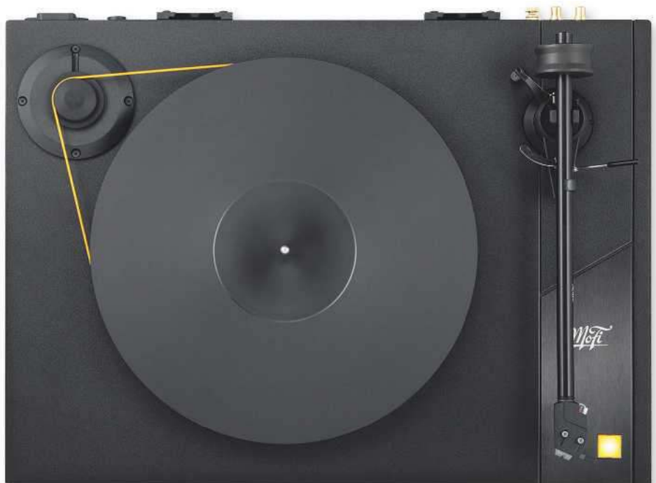
RIGHT: Sharing the same tonearm (non-Cardas wiring), AC synchronous motor and inverted bearing as the UltraDeck, the StudioDeck has a thinner Delrin platter (19mm versus 33mm)

'One can tell that the same ears "voiced" both decks'