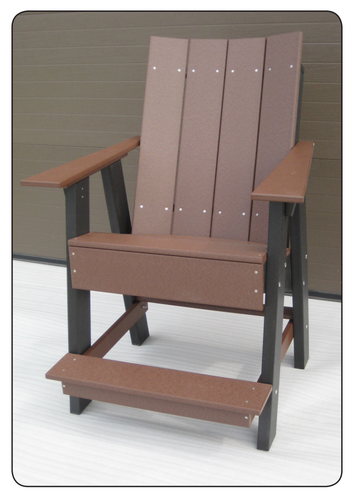
Step 4 Your high adirondack chair is now complete. Thank you for purchasing from Wildridge.