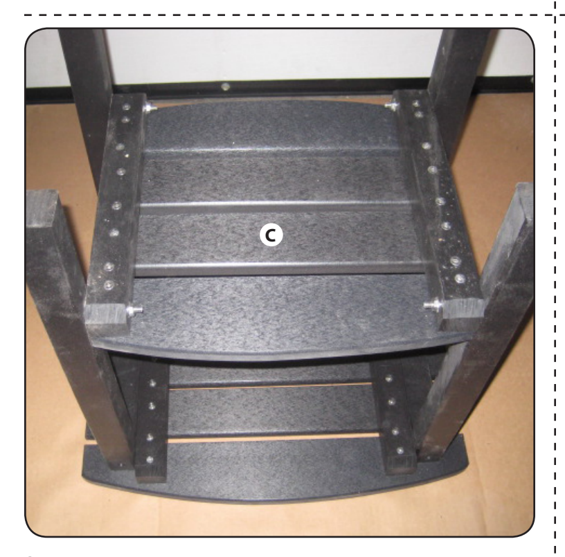
Step 2 Attach the shelf as shown (C), with (4) 1/4" x 3 1/2" bolts and (4) 1/4" flange nuts, one per leg.

Lay table top (A) upside down on a soft surface and place the legs (B) in place, butting them up against the corner of the two stretchers, making sure all countersink holes in the legs are facing towards the outside. Fasten with (2) 2 1/2" screws per leg.