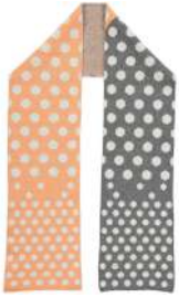
GREY & PEACH BIG SPOT/LITTLE SPOT SCARF 123016