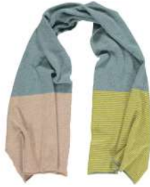
SEA GREEN & ELECTRIC YELLOW WIDE STRIPE SCARF 123020