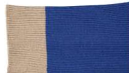
MARINE BLUE & SOFT BROWN RIBBED SNOOD 123029