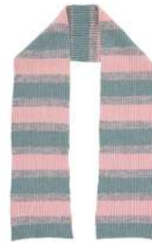
SEA GREEN & PINK MARL STRIPE SCARF 123022