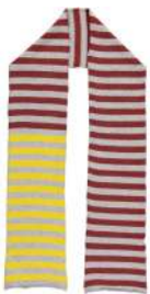
SIENNA & ELECTRIC YELLOW STRIPE SCARF 123027