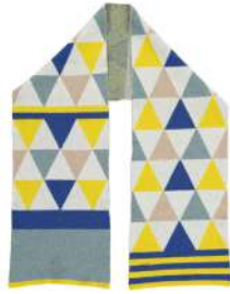
GREY, YELLOW & MARINE BLUE TRIANGLE SCARF 123017