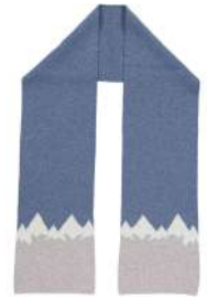
GREY & DENIM MOUNTAIN SCARF 123019