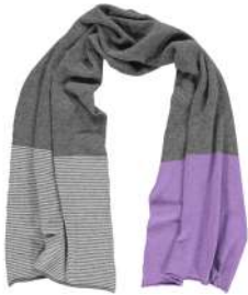
GREY & LILAC WIDE STRIPE SCARF 123015