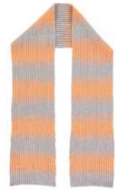
PEACH & CONCRETE MARL STRIPE SCARF 123023