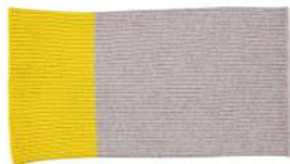
CONCRETE & ELECTRIC YELLOW RIBBED SNOOD 123028