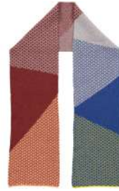
MARINE BLUE, CONCRETE & SIENNA CROSS BLOCK SCARF 123018