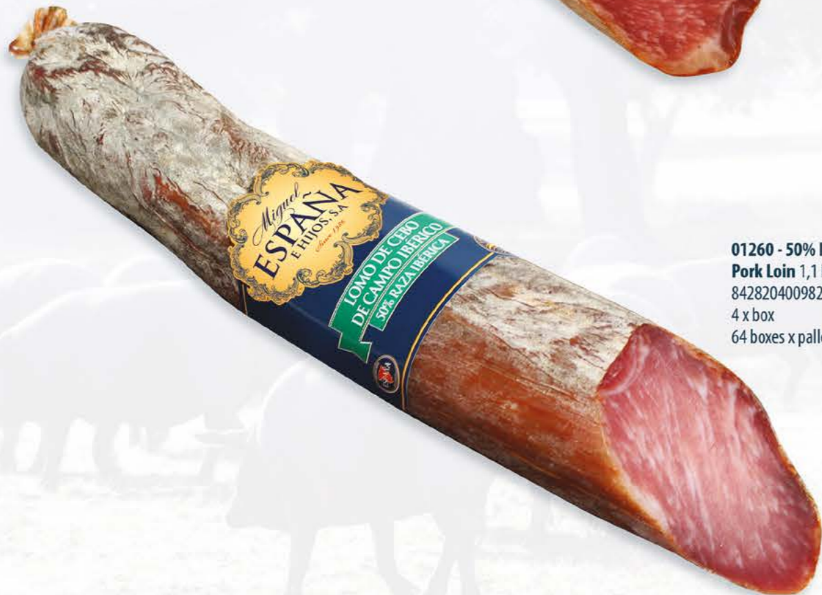
01260 - 50% Ibérico de Cebo de Campo Pork Loin 1,1 kg aprox. 8428204009827 4 x box 64 boxes x pallet