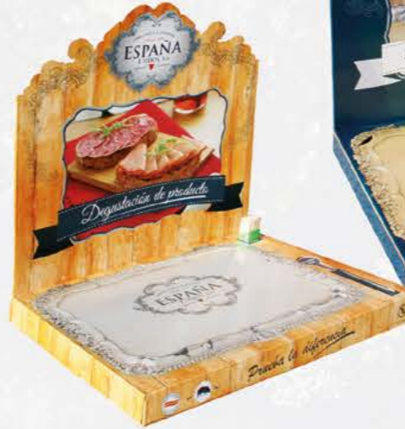
07167 - Tasting tray