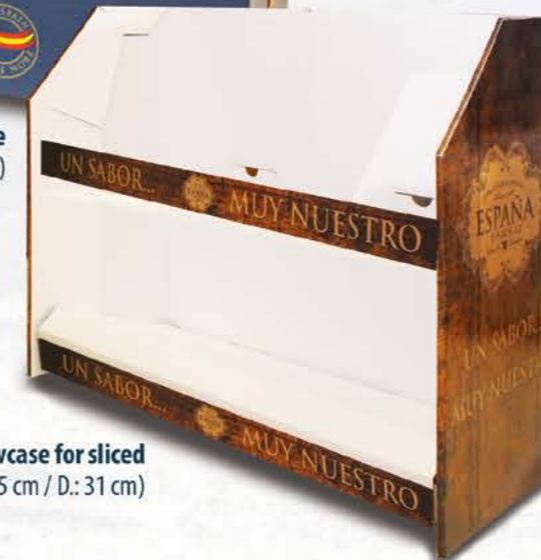
07082 - Showcase for sliced (W.: 72 cm / H.: 62,5 cm / D.: 31 cm)