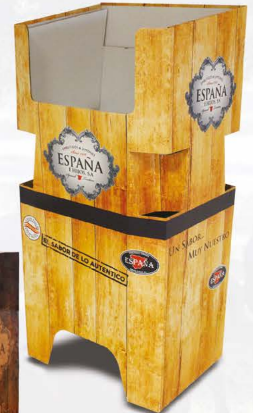
07187 - Showcase for cold products (W.: 104 cm / H.: 50 cm / D.: 37 cm)