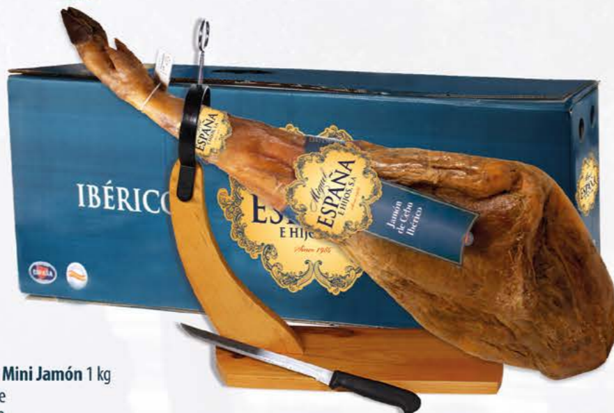
02005PZAG - 50% Ibérico de Cebo Jamón 7 kg aprox. + Stand + Knife 8428204005348 1 x box 48 boxes x pallet