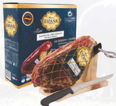
02288 - 50% Ibérico de Cebo Mini Jamón 7 kg aprox. + Stand + Knife 8428204008196 6 x box 48 boxes x pallet