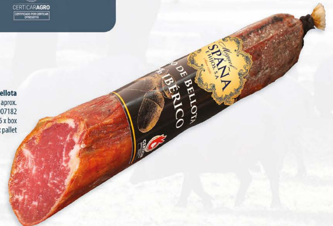
01207 - 100% Ibérico Bellota Pork Loin 1,1 kg aprox. 8428204007182 6 x box 64 boxes x pallet