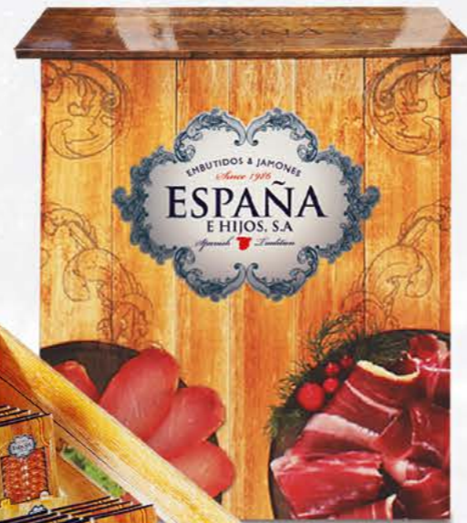
07130 - Degustation table (W.: 70 cm / H.: 80 cm / D.: 40 cm)