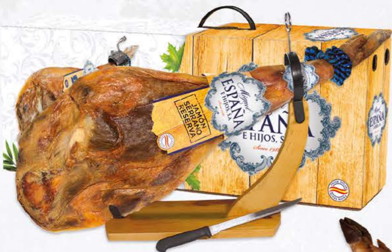
02003PZAG - Reserva Serrano Jamón 6,3 kg aprox. + Stand + Knife 8428204005027 1 x box 48 boxes x pallet