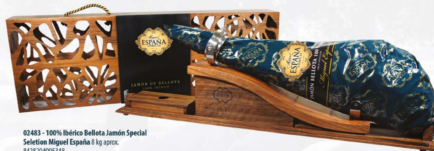
02483 - 100% Ibérico Bellota Jamón Special Selecion Miguel España 8 kg aprox. 8428204005348 1 x box 15 boxes x pallet