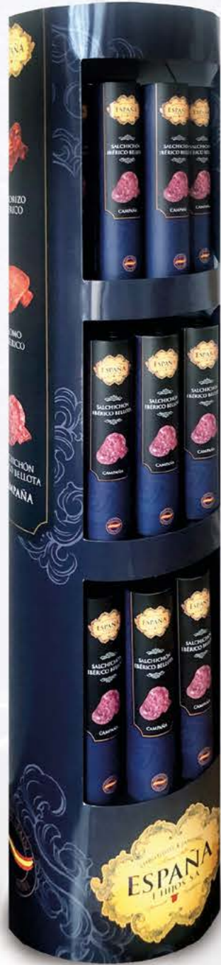
07171 - Special Showcase for Ibérico Products (W.: 38 cm / H.: 158 cm / D.: 38 cm)