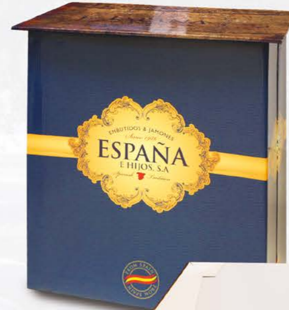
07130IB - Degustation table (W.: 70 cm / H.: 80 cm / D.: 40 cm)