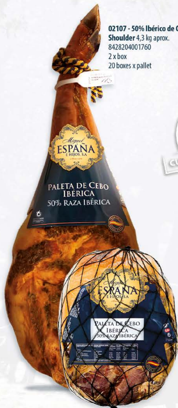
02107 - 50% Ibérico de Cebo Shoulder 4,3 kg aprox. 8428204001760 2 x box 20 boxes x pallet