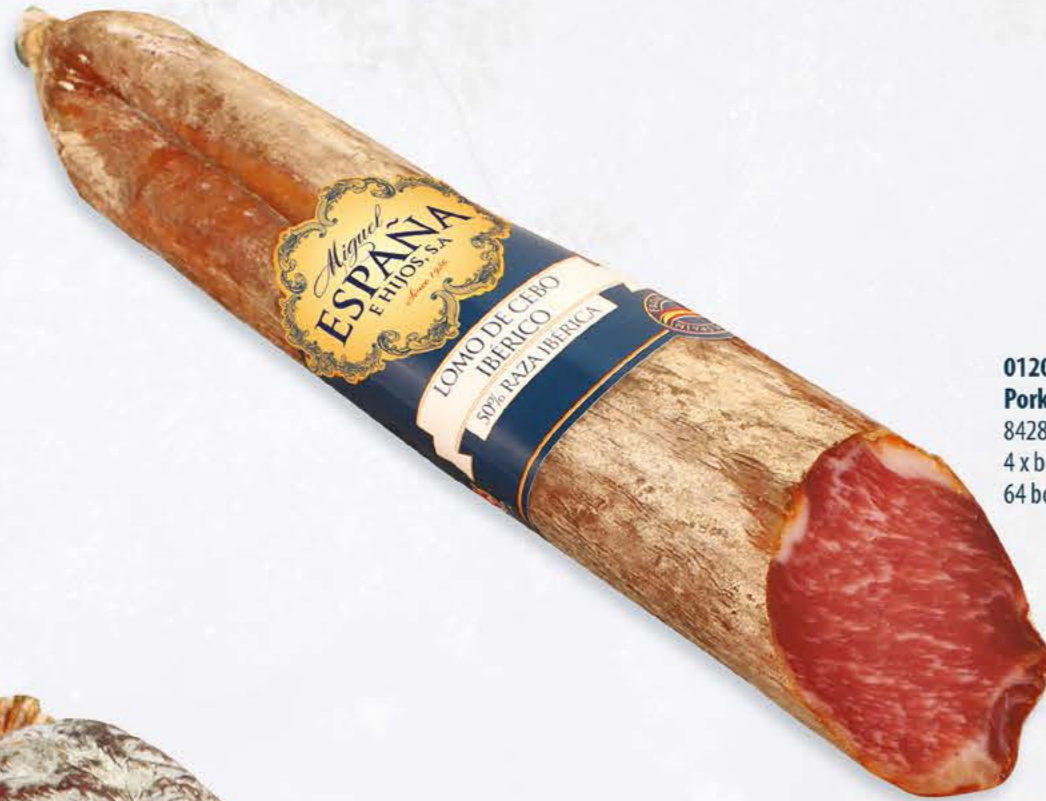
01203 - 50% Ibérico de Cebo Pork Loin 1,2 kg aprox. 8428204003429 4 x box 64 boxes x pallet