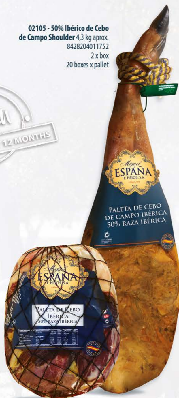
02105 - 50% Ibérico de Cebo de Campo Shoulder 4,3 kg aprox. 8428204011752 2 x box 20 boxes x pallet