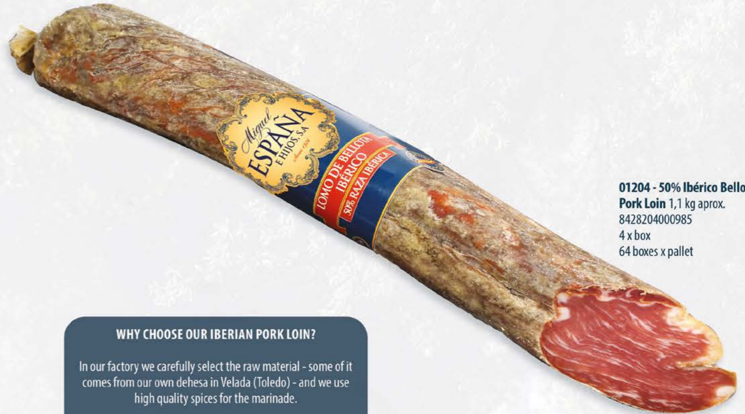
01204 - 50% Ibérico Bellota Pork Loin 1,1 kg aprox. 8428204000985 4 x box 64 boxes x pallet