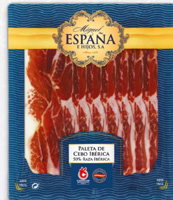
01506 - 50% Ibérico de Cebo Shoulder 80 g 8428204015064 18 x box 174 boxes x pallet