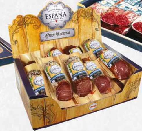
07017 - Box Gran Reserva