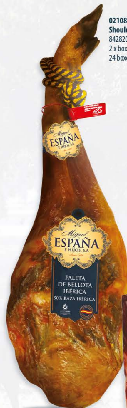
02108B - 50% Ibérico Bellota Shoulder 4,3 kg aprox. 8428204011752 2 x box 24 boxes x pallet