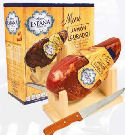
02225 - Cured Mini Jamón 1 kg + Stand + Knife 8428204007489 6 x box 48 boxes x pallet