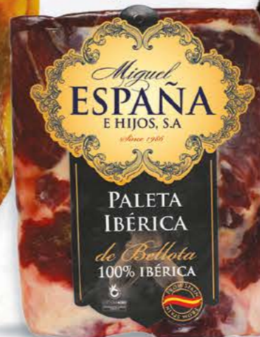
02214L - 100% Ibérico Bellota Boneless Shoulder 4 kg aprox. 8428204007854 4 x caja 48 boxes x pallet