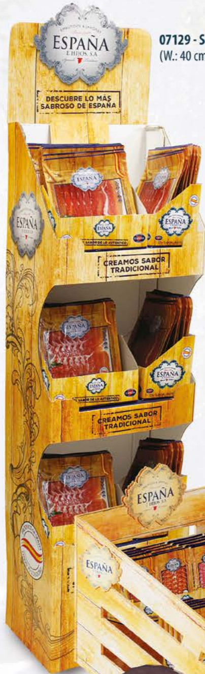
07129 - Showcase with 3 shelves (W.: 40 cm / H.: 170 cm / D.: 31 cm)