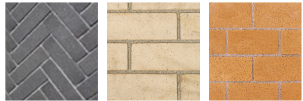
Split Herringbone Split Running Bond Full Running Bond