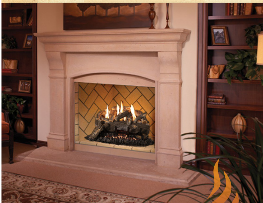
Shown with Virginia Log Set