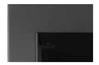
1pc. adjustable finishing trim included