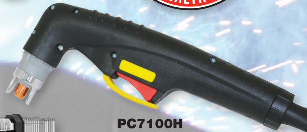
PC7100H Plasma torch included