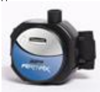
R60 AIRMAX* blower unit