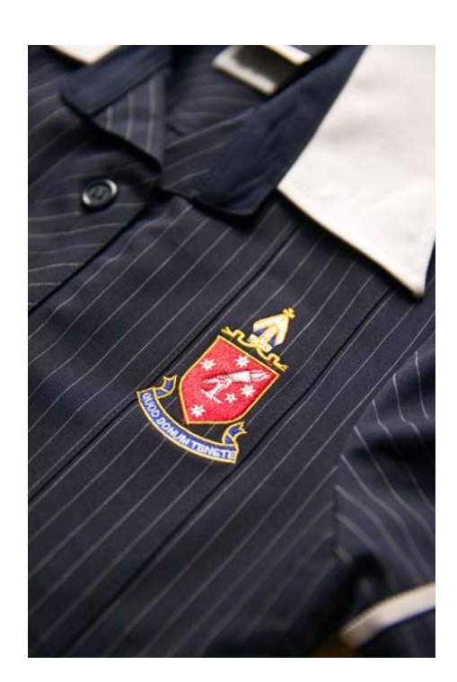
The Peninsula Grammar School community has a uniform that inspires pride while being functional, versatile and long-lasting.

"The new uniform is a lot comfier for me, I think the material is made of a softer fabric. I like the summer uniform because you don't have to tuck your shirt in and wear a tie. The tie makes you feel hot in summer."