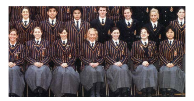
Year 10 students are now included in the Senior School and wear the striped blazer