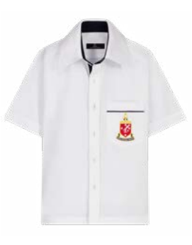
SHORT SLEEVE SHIRT (CLASSIC AND TAILORED)