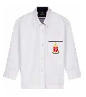
LONG SLEEVE SHIRT (CLASSIC AND TAILORED)