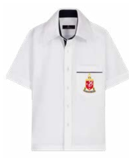
SHORT SLEEVE SHIRT (CLASSIC AND TAILORED)