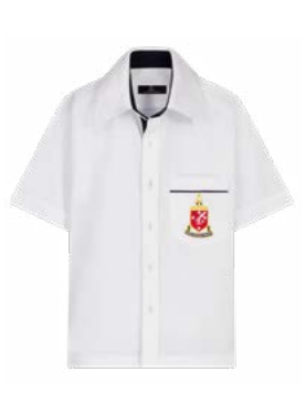
SHORT SLEEVE SHIRT (CLASSIC AND TAILORED)