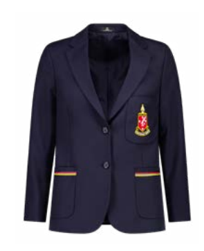
NAVY BLAZER (CLASSIC AND TAILORED)