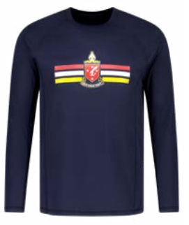
PE LONG SLEEVED TOP