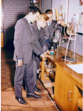
Senior boys, 1962