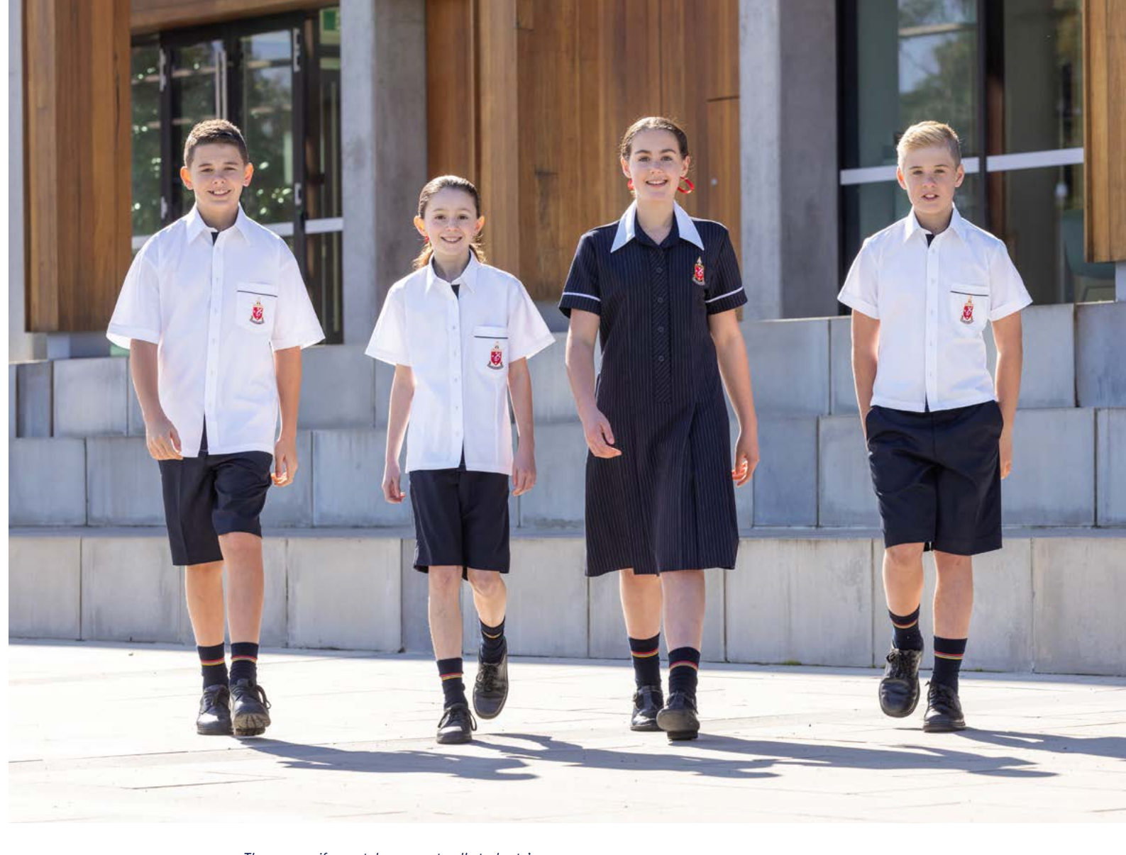
The new uniform style supports all students' needs and promotes our values of inclusivity and equality.