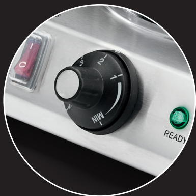
Independent Adjustable Thermostats