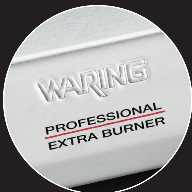
Brushed Stainless Steel Finish