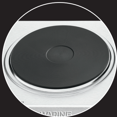
Heavy-duty Cast-iron Burner Plates