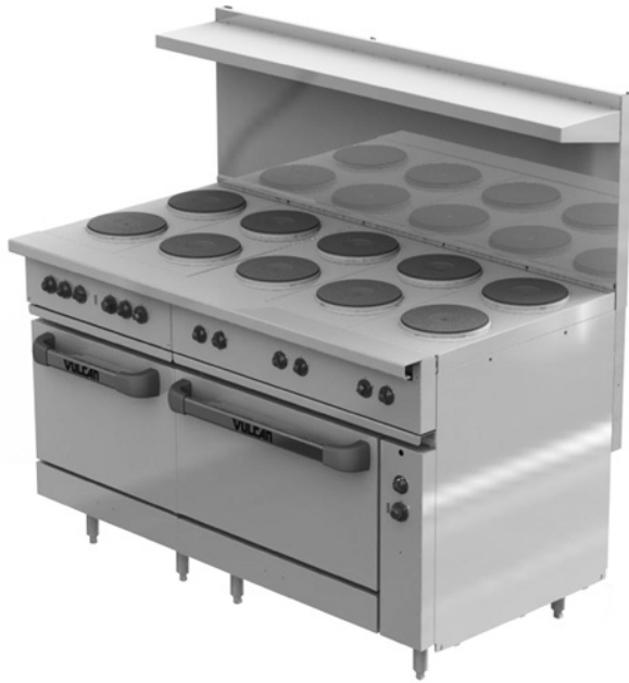
Model EV60SS-10FP208 shown with adjustable legs