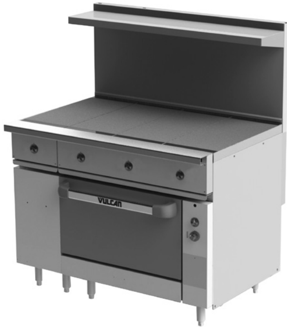
Model EV48S-4HT208 shown with adjustable legs