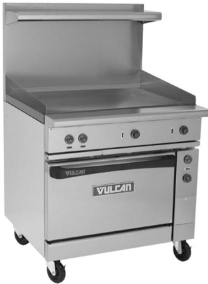
Model EV36-S-36G-208 shown with optional casters