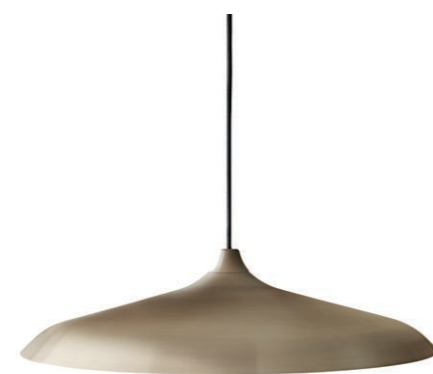
BRUSHED BRONZE 1680869