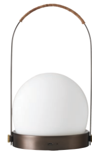
BRONZED BRASS 4864859Y

Bound with soft yet durable leather on its browned metal handle, the portable Carrie LED Lamp holds a warm orb of light in its basket-like base. Providing up to ten hours of light when fully charged, the lamp moves effortlessly from the table to the terrasse or a bookcase to a desk, illuminating the dark with its sophisticated glow. The cordless design charges via a concealed magnetic connector and USB cable. The cable charges with a standard USB charger plug. Comes without charger plug. To preserve battery life, switch the lamp off when charging and do not leave plugged in while in use.