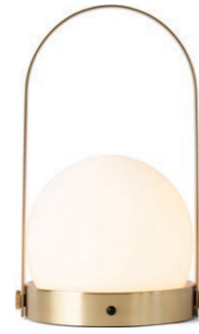
BRUSHED BRASS 4863839

Portable, lightweight and cordless lamp with a USB charger, opal glass shade and powder coated steel or brushed brass frame. To preserve battery life, switch the lamp off when charging and do not leave plugged in while in use.