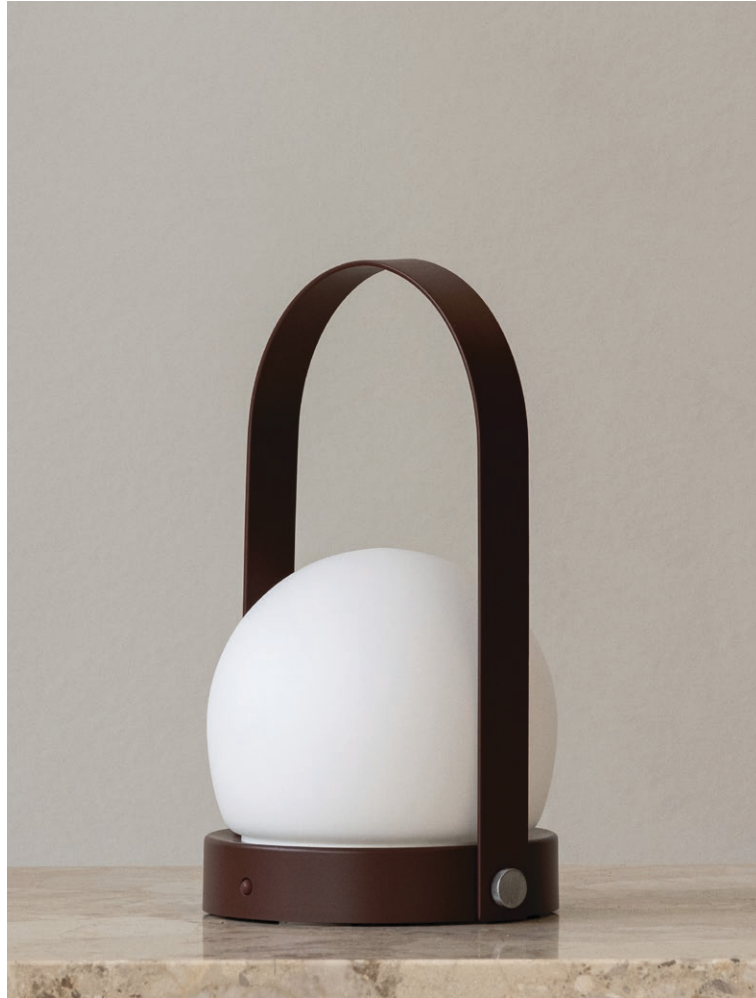
CARRIE TABLE LAMP, PORTABLE Designed by Norm Architects