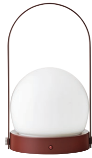
BURNED RED 4864349