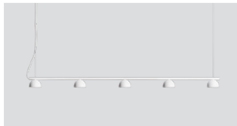
Blush pendant rail 5 white - Item no. 153