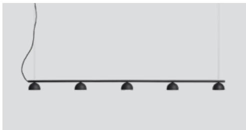
Blush pendant rail 5 black - Item no. 151