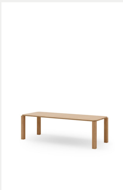
Variant Natural Oak Item No 42720 EAN No 5712826427200