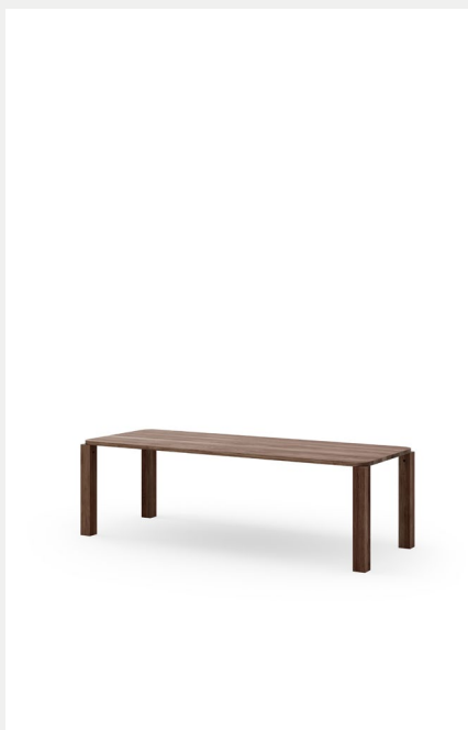
Variant Fumed Oak Item No 42721 EAN No 5712826427217