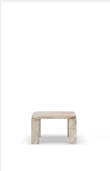
Variant Unfilled Travertine Item No 42620 EAN No 5712826426203