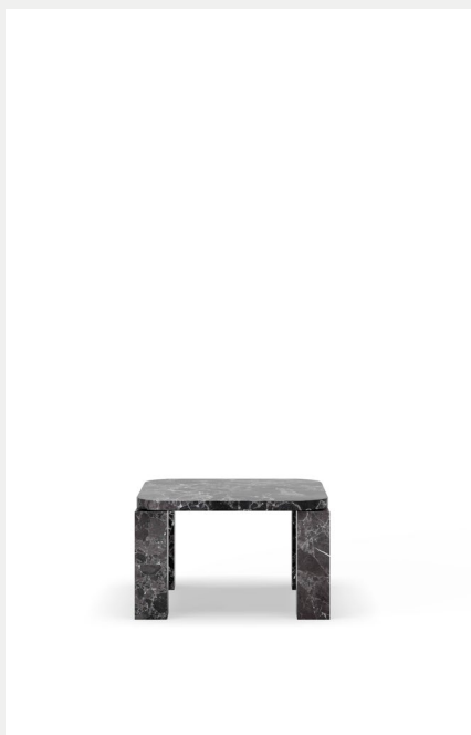
Variant Costa Black Item No 42621 EAN No 5712826426210