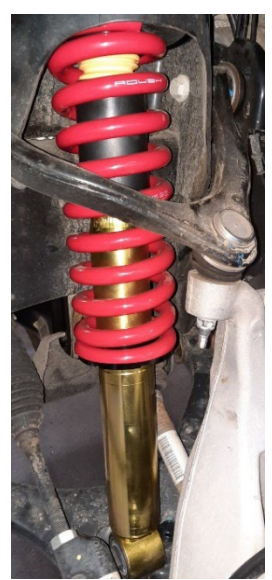
ROUSH F-150 Suspension Shown