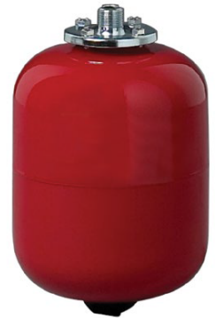
Dimensions – All measurements in mm unless otherwise stated