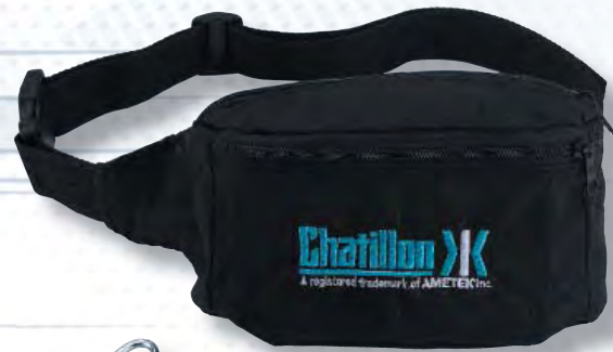
IN Series with optional Carrying Case (NC002845)