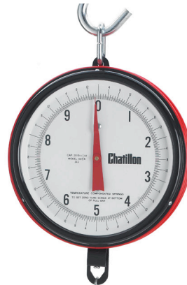
Shown with optional CAS Pan