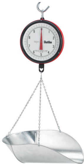
Shown with optional CG Scoop