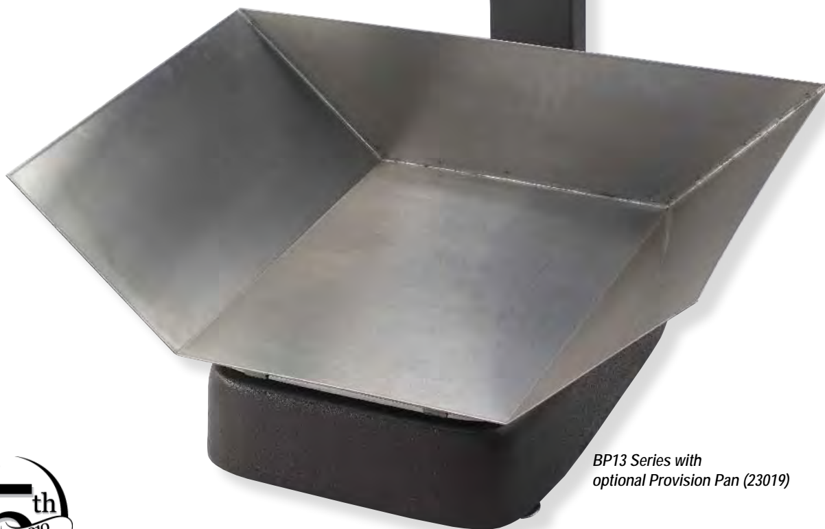
BP13 Series with optional Provision Pan (23019)