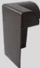
External Corner Dimensions 57mm (W) x 100mm (D)