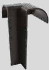
Internal Corner Dimensions 20mm (W) x 100mm (D)