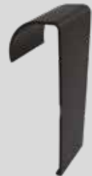
Dimensions 40mm (W) x 100mm (D)