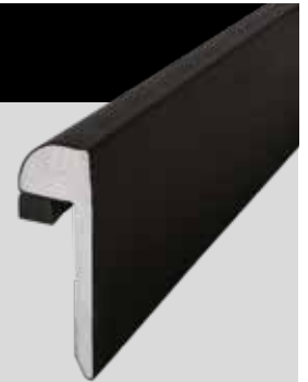
Length Dimensions 2.5m (L) x 100mm (D)