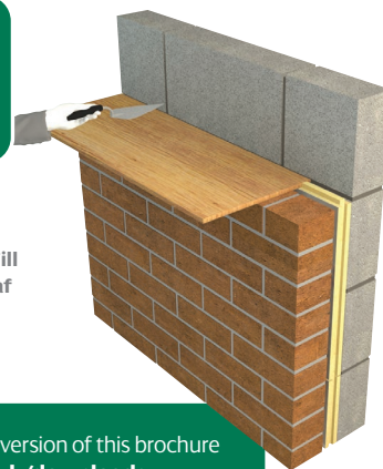
Figure 2 - Use of Eco-Cavity Full Fill when installing the inner wall leaf

To check that you have the latest version of this brochure please visit www.ecotherm.co.uk/downloads .