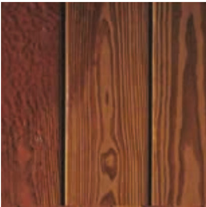
Strip off any old coating before redecorating the deck – you might like the look of the wood you reveal.

All traces of a previous paint or stain should be removed by scraping, sanding or using a product made especially for stripping coatings from wood. When using deck cleaning or stripping products always follow the manufacturer's instructions.