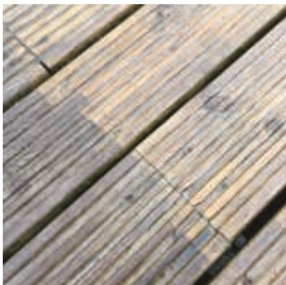
A 15 year old deck mid its annual clean

Once the deck is clean and dry a surface treatment can be applied that provides weather resistance and enhances the natural shade of the wood or gives the deck a brand new look. Surface treatments range from clear waterproofing sealers to tinted and solid stains. Always follow the manufacturer's instructions.