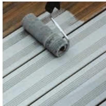
Owatrol solid colour stain applied by roller