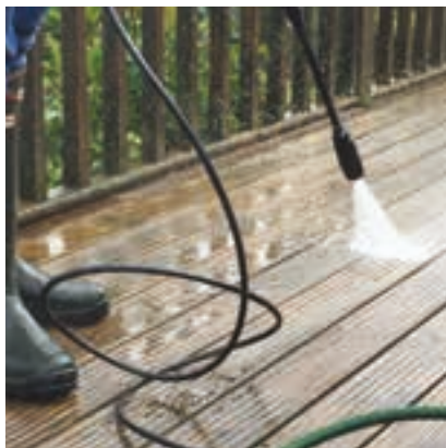
Pressure washing can be too aggressive – use with care