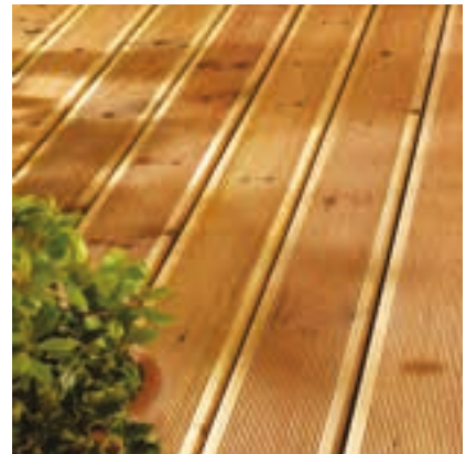
...and after the cleaning