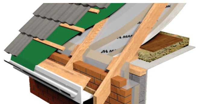
Pitched roof: MLK below rafters