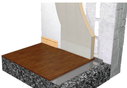
Solid walls: internal dry lining MLK fixed to plaster dabs