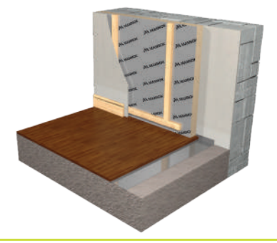
Solid walls: internal dry lining MW fixed by battens