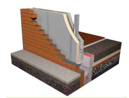
Cavity walls: MW in steel stud frame