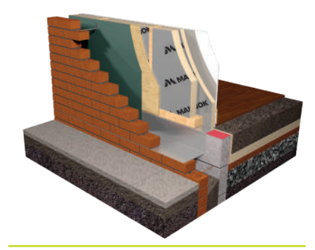
Cavity walls: MW in timber frame*