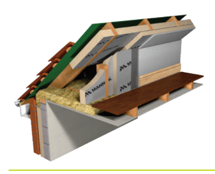
Wall: room in roof