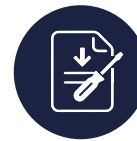
Quick To Install