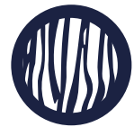
Woodgrain Effect Surface