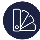
Available In 4 Colours