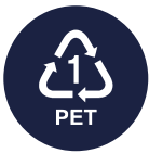
Recycled PET Felt Base

Available in 600mm lengths, each Panel simply sits flush with the next Panel and is secured through the recycled felt base. Each Panel can be cut with a handsaw or circular saw, or a utility knife through the felt.