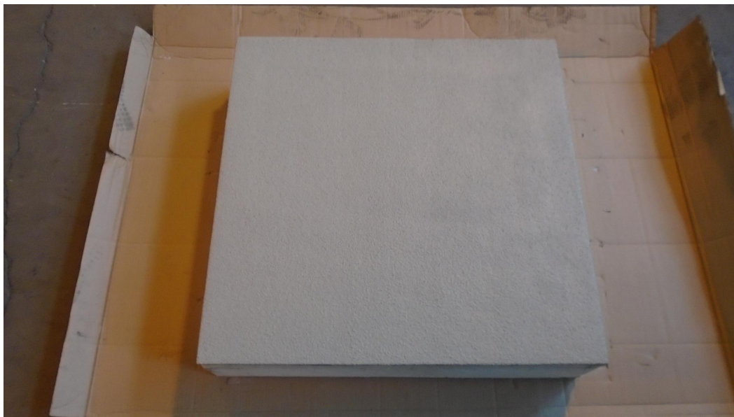
Figure 1: Test face