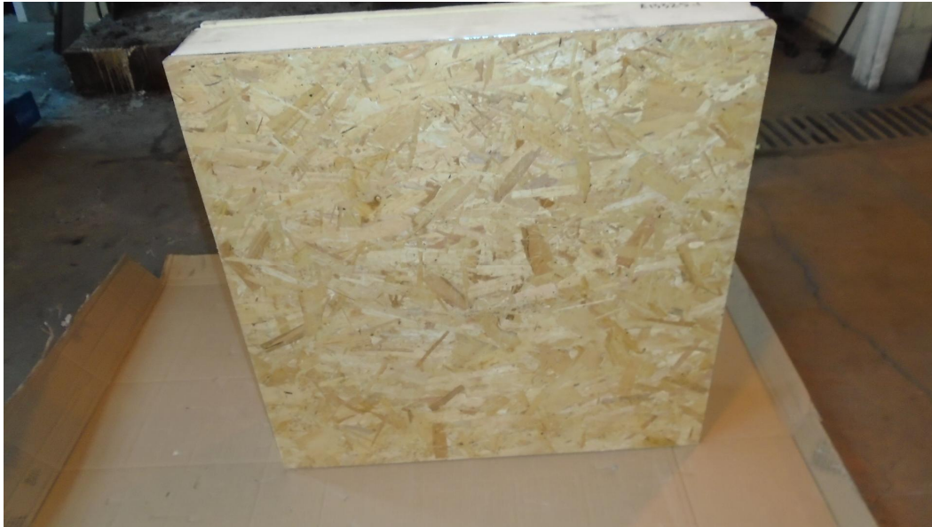
Figure 3: Back view