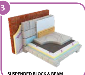
SUSPENDED BLOCK & BEAM