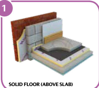
SOLID FLOOR (ABOVE SLAB)