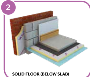
SOLID FLOOR (BELOW SLAB)