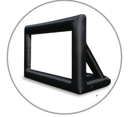
1 - Projection screen