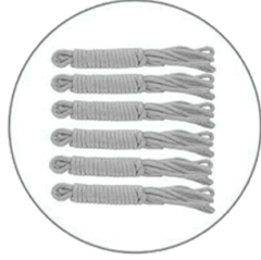
6 - 13 Ft ropes