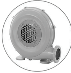
1 - 120V air blower