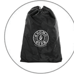
1 - Carrying bag