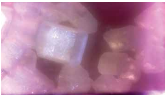
Video micrograph of drug active ingredient recorded on MicromATR Vision

Optional crystal plates for the MicromATR Vision include germanium (Ge) for high refractive index samples, Diamond 3X (3 reflection) and Diamond 9X (9 reflection) crystal plates (limited pressure) for low concentration components. Crystal plates are kinematic and easily exchangeable with no alignment, tools or screws required. The MicromATR Vision is also compatible with crystal plates from some other manufacturers.