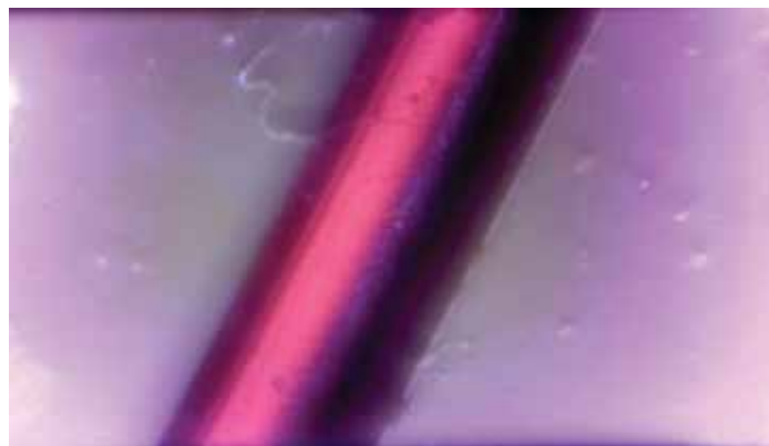
Image capture of single fiber showing the fiber positioned and intimate contact on the ATR crystal.

The small diameter of the crystal broadens the sample range from macro to microsampling. Integrated viewing optics with illumination of the sample through the diamond ATR crystal enables selection of discreet sample features and provides visual proof of sample contact.