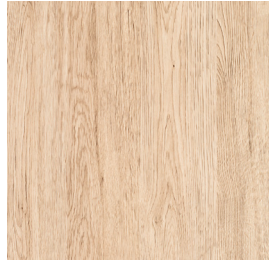
Natural Oak RN