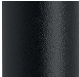
Matte Anthracite VA