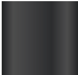
Black Glossy Nickel NL