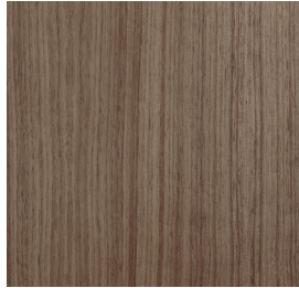
Canaletto Walnut NC