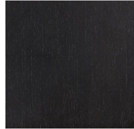
Black Stained Oak NR