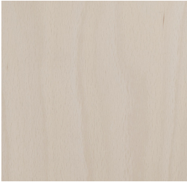
Bleached Beech FS