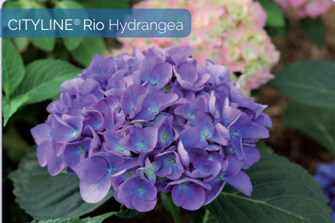
CITYLINE® Rio Hydrangea

Hydrangea Fun Fact There are about 49 species of hydrangeas. Four species are native to North America, including smooth hydrangea and oakleaf hydrangea.