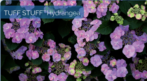
TUFF STUFF® Hydrangea