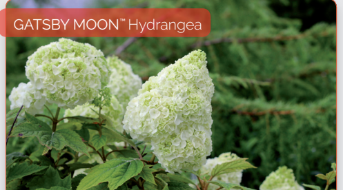
GATSBY MOON™ Hydrangea

Proven Winners® varieties: TUFF STUFF™ series