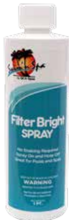
Bottle shown without included spray nozzle.

The cartridge filter does a big job by removing many of the body oils and minerals found in your spa water. With regular cleaning you can extend the life of the filter.