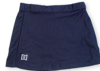
S1 | Navy