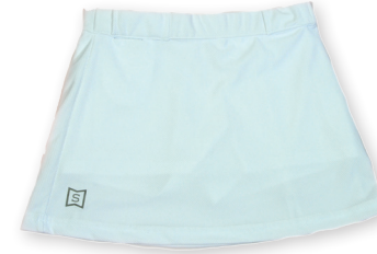
S2 | White