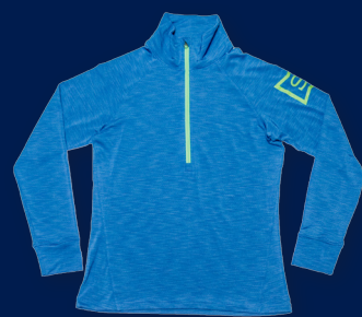
HZ1 | Twilight & Electric Lime

This breathable long sleeve half-zip makes layering fun without restricting your swing. It's lightweight for great portability. Great for cool mornings or afternoons, but don't worry: the materials are performance wicking to leave you cool when the weather heats up.