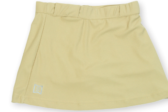
S3 | Khaki