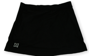
S4 | Black