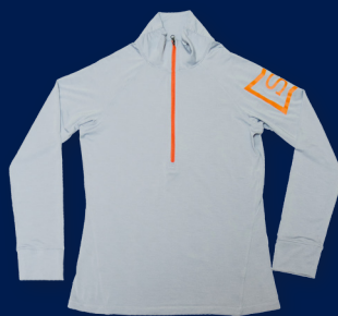
HZ2 | Platinum & Tangerine