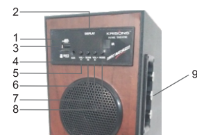
Front & Side View